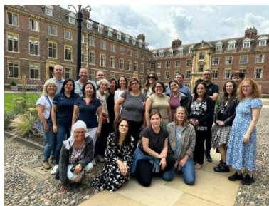
EXCEL Institute participants in Main Court