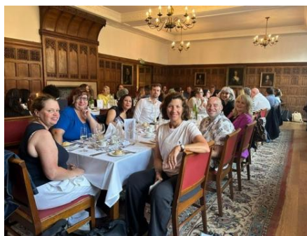
EXCEL Institute participants sharing a meal in the Senior Combination Room